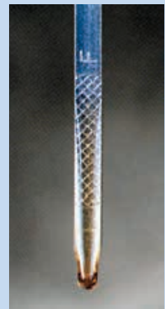
After an oil change and Advantage Flush Service